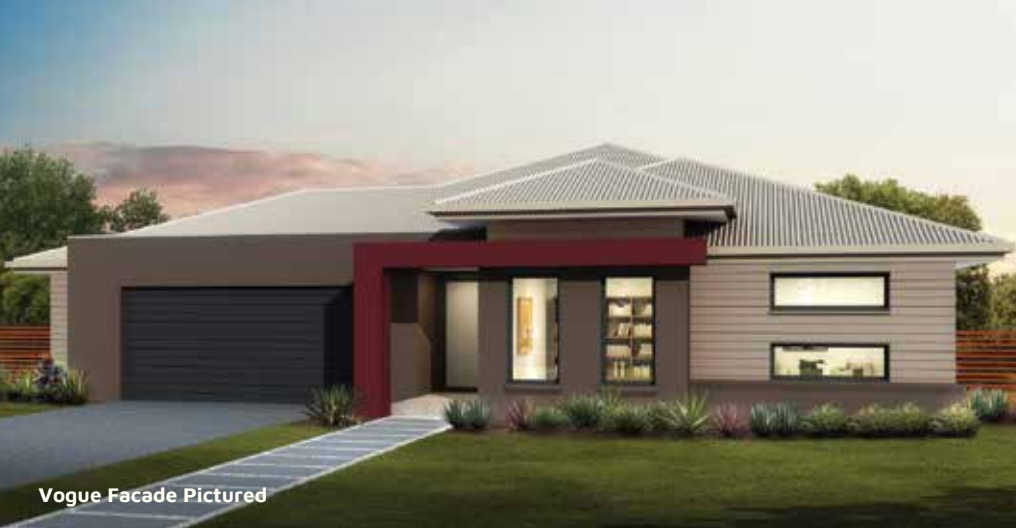
Vogue Facade Pictured